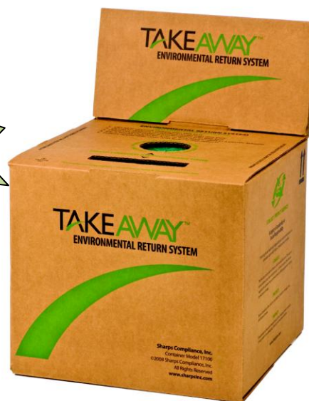
TakeAway™ 10 Gallon Pharmacy Drop Box

An estimated 250 million pounds of unused medications are improperly disposed of each year. 1